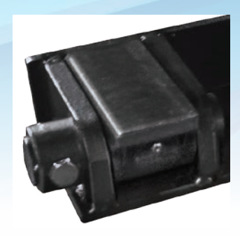
Greaseable Rear Hinge with Optional Removable Pin.