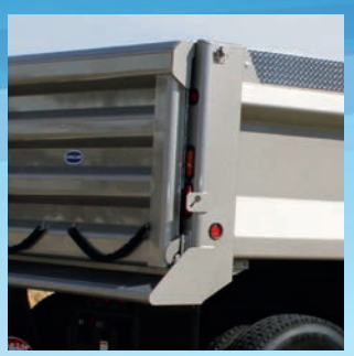
DuraClass bodies come with full depth corner posts and enclosed tailgate hardware.