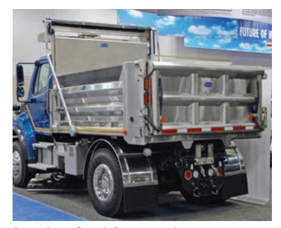
Premium Steel Construction- Minimum 45,000 psi. Additional steel and stainless steel options available.